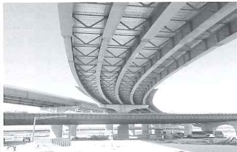
JOHNS PASS MADERIA BEACH, FL