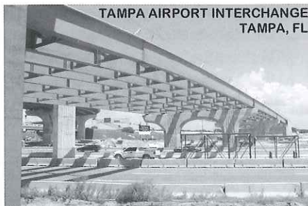
TAMPA AIRPORT INTERCHANGE TAMPA, FL