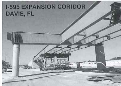
I-595 EXPANSION CORRIDOR DAVIE, FL