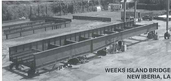
WEEKS ISLAND BRIDGE NEW IBERIA, LA